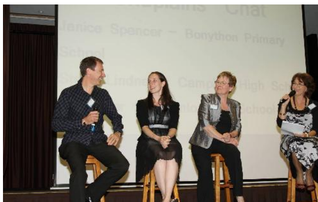
Chaplains speaking at the Regen Dinner

Since the Federal Government announcement regarding funding for the National School Chaplaincy Program for an extended period 2012-14, SU Australian Capital Territory has sought expressions of interest from those ACT schools that missed receiving funding in the original program which commenced in 2007. Across Australia, the Government