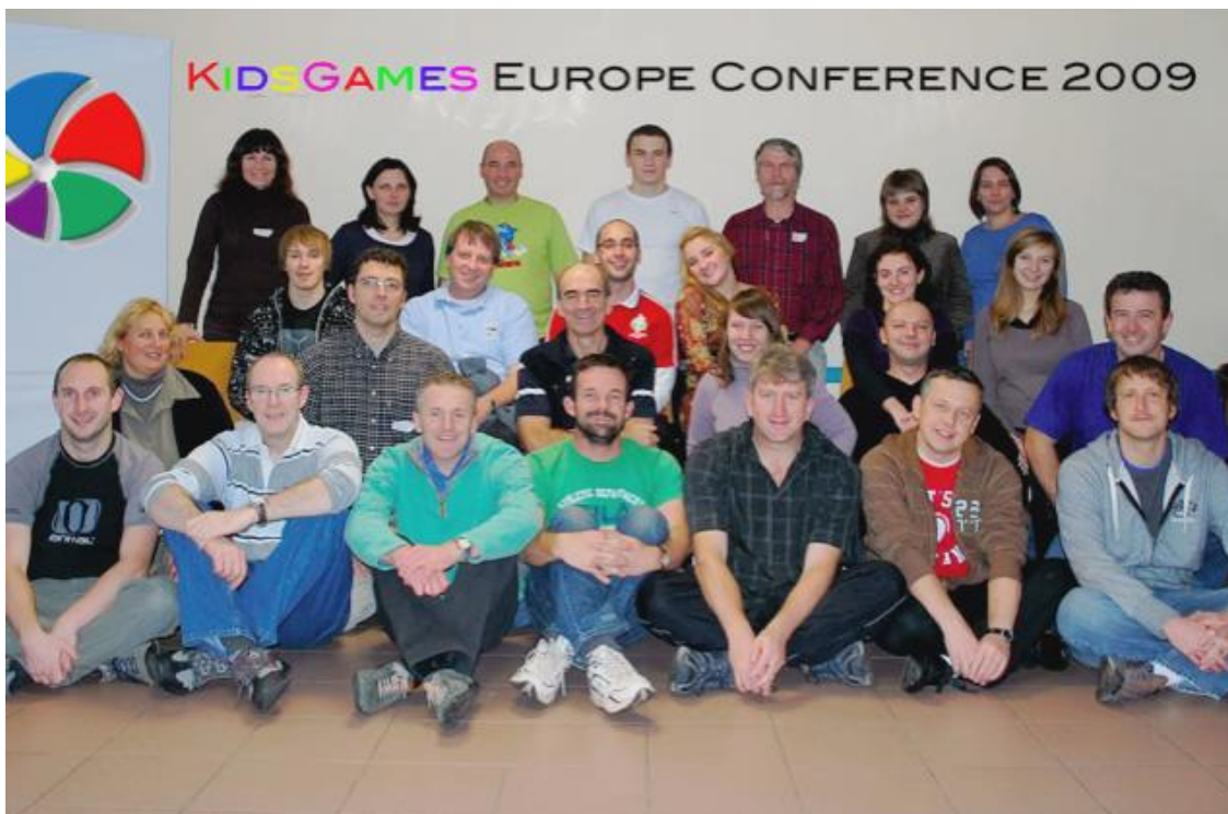
SU and representative of other organisations with a heart for the children of Europe