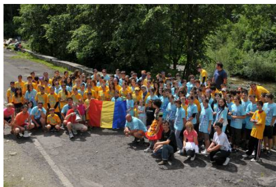
Our core of young volunteers

Please pray for our new campaign starting this spring "A Clean City Needs a Clean Heart". We want to demonstrate our serving hearts by cleaning the parks in Timisoara, our local city.